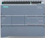
SIEMENS PLC S7-1200