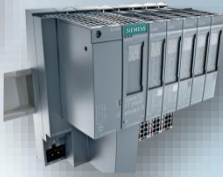
SIEMENS PLC ET 200SP IO